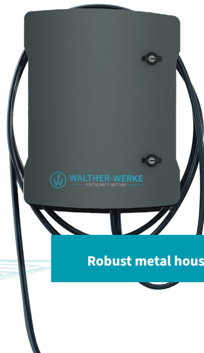
Robust metal housing

Above all, the robust metal housing is your guarantee for safe operation indoors and outdoors.